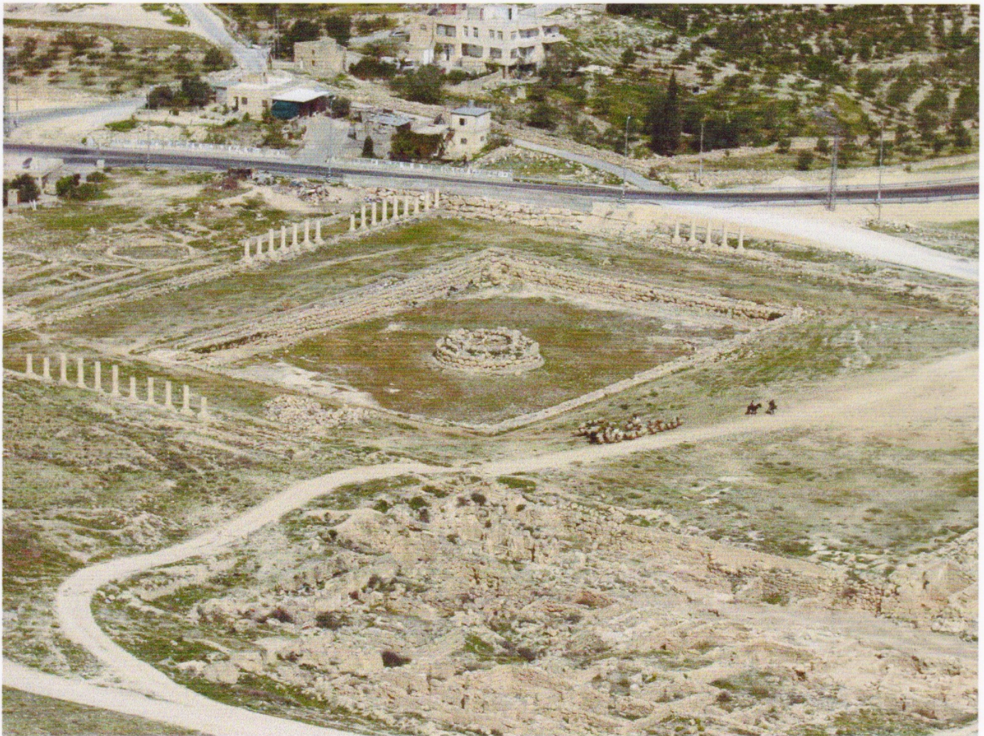
BETHLEHEM : THE PALACE OF HEROD