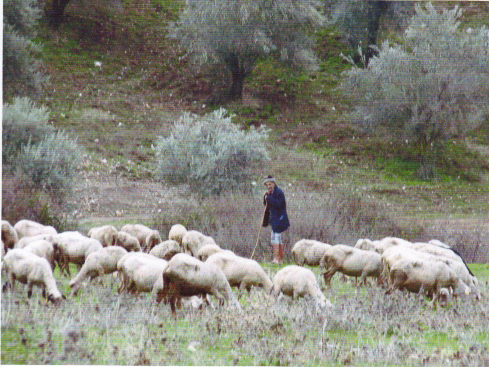
COLLOSSAE: A SHEPHERD